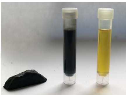
Cleaned oil, dirty oil and dried waste.